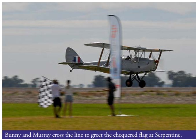
Bunny and Murray cross the line to greet the chequered flag at Serpentine.